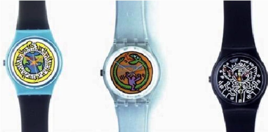
Keith Haring designed these watches for Swatch in 1985.

Use your imagination to make a pattern for your own watch. Try making different kinds of designs by changing the shape of the hands or the face, or even the wristband.