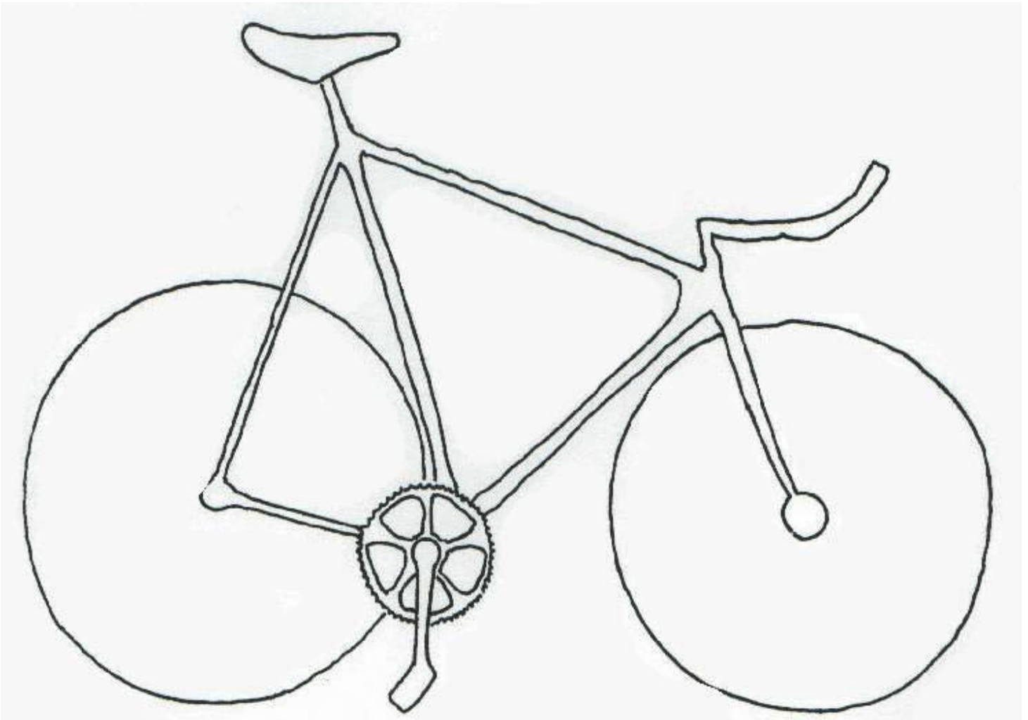
Keith Haring painted this bicycle in 1989.

Lesson: Katonah Museum of Art, Learning Center