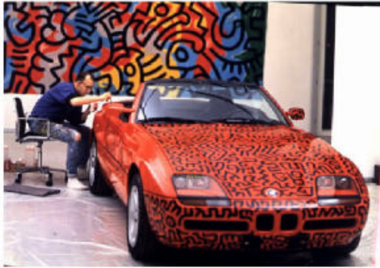
Keith Haring painting a BMW convertible in 1989.

Use your imagination to design your own painted car. What color would you want it to be? What patterns or pictures would you like your friends to see when you drive your car?