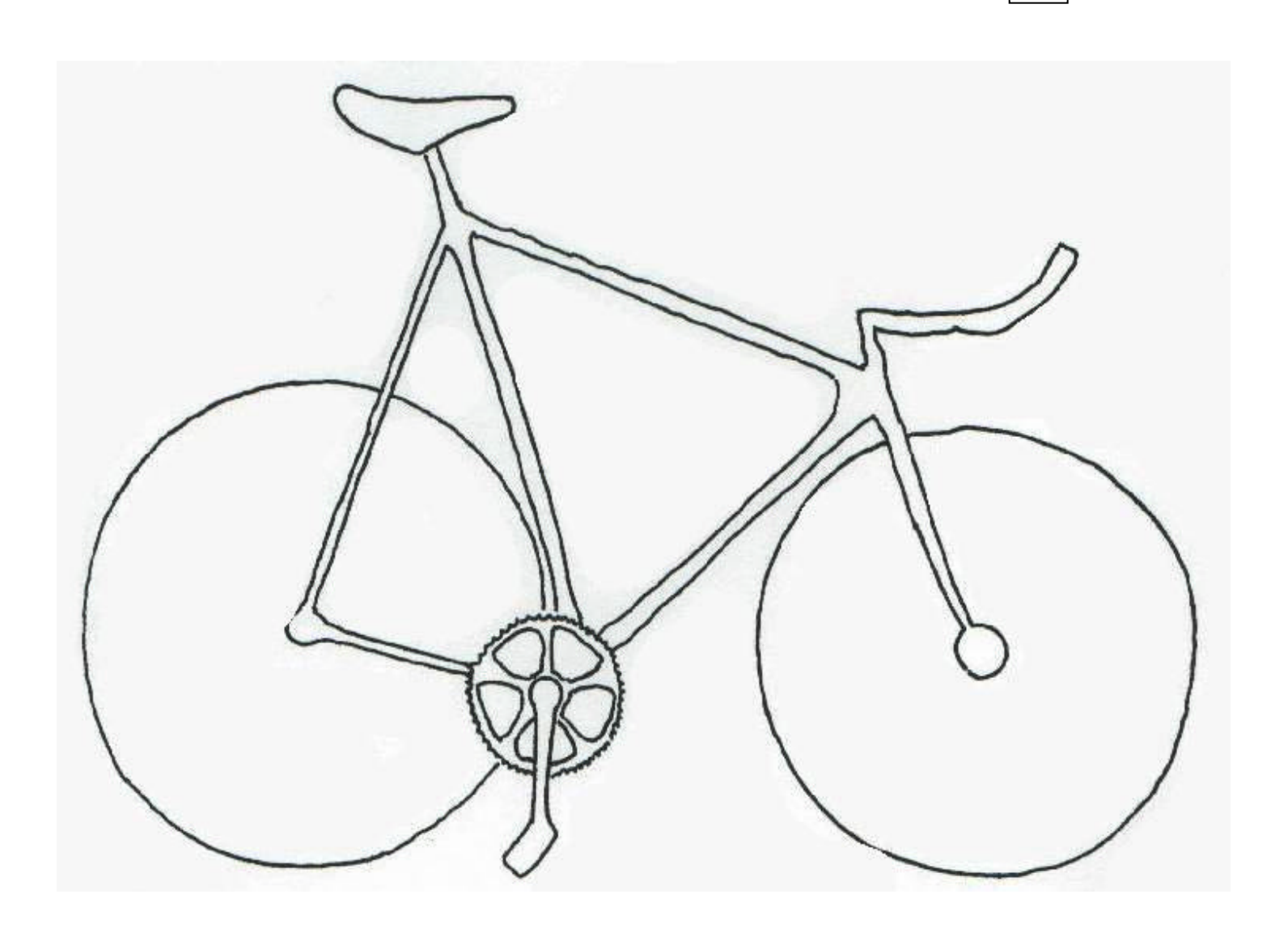
Lesson: Katonah Museum of Art, Learning Center

Keith Haring painted this bicycle in 1989.