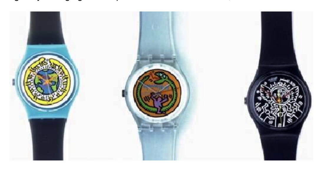
Keith Haring designed these watches for Swatch in 1985.

Use your imagination to make a pattern for your own watch. Try making different kinds of designs by changing the shape of the hands or the face, or even the wristband.